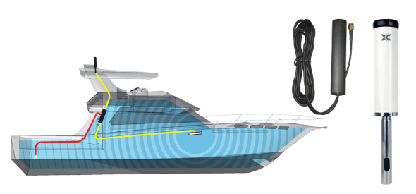
Cel-Fi GO Marine

The Cel-Fi GO all-in-one Smart Signal Repeater is also the best solution for addressing the universal challenge of poor cellular coverage on the move. Simply select the appropriate donor/server antenna bundle to achieve the best voice and data wireless performance for vehicles and boats.